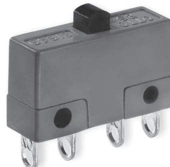
Solder Terminal Style

The molded housing is rugged and structurally stable. The terminals are sealed against solder flux entering the switch and are bright acid tin plated for excellent solderability.